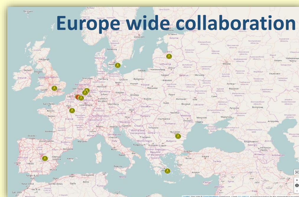
Europe wide collaboration