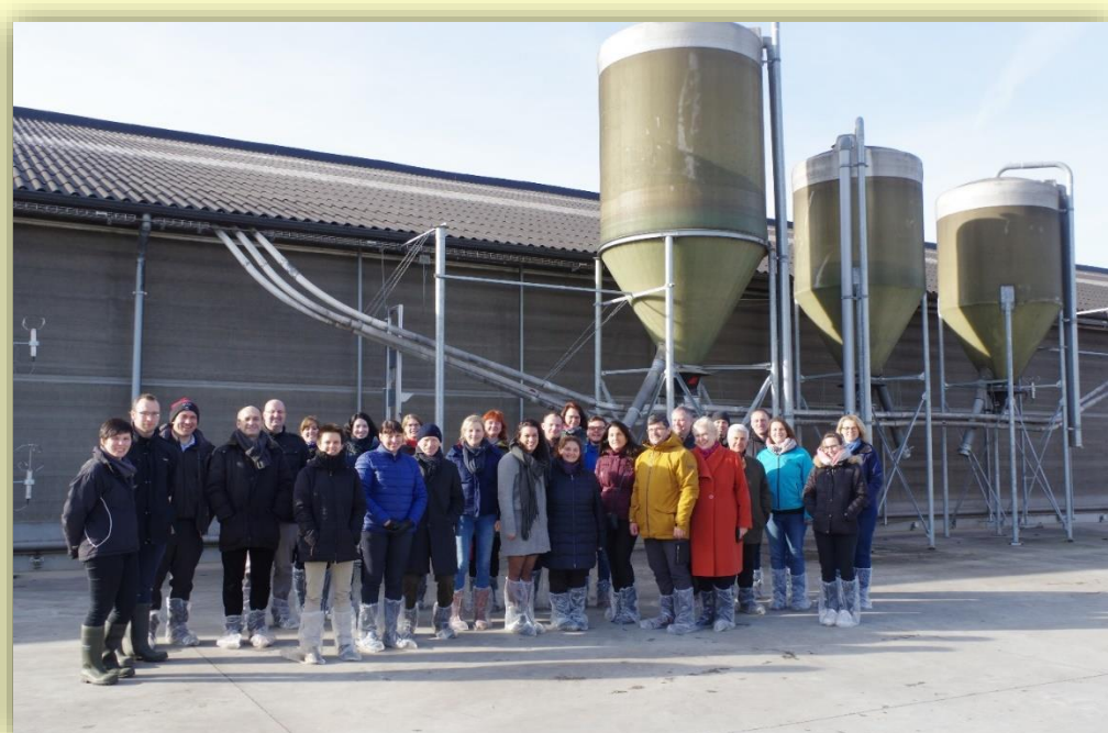
DISARM consortium members to promote responsible use of antibiotics in livestock farming by actively identifying, sharing and disseminating best practices.